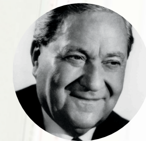
Carlo Schmid, 1896-1979 Founding Father of the German Constitution and the IB